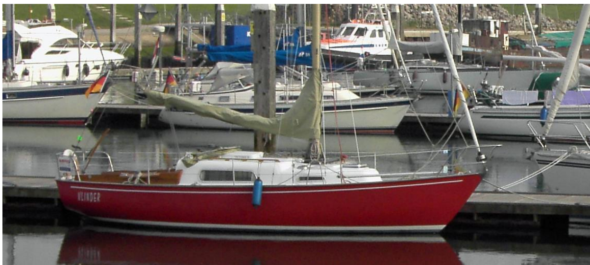
afb. 6 V28 finkeel 1974, hullnummer 69 'Vlinder' (photo 10-2012)