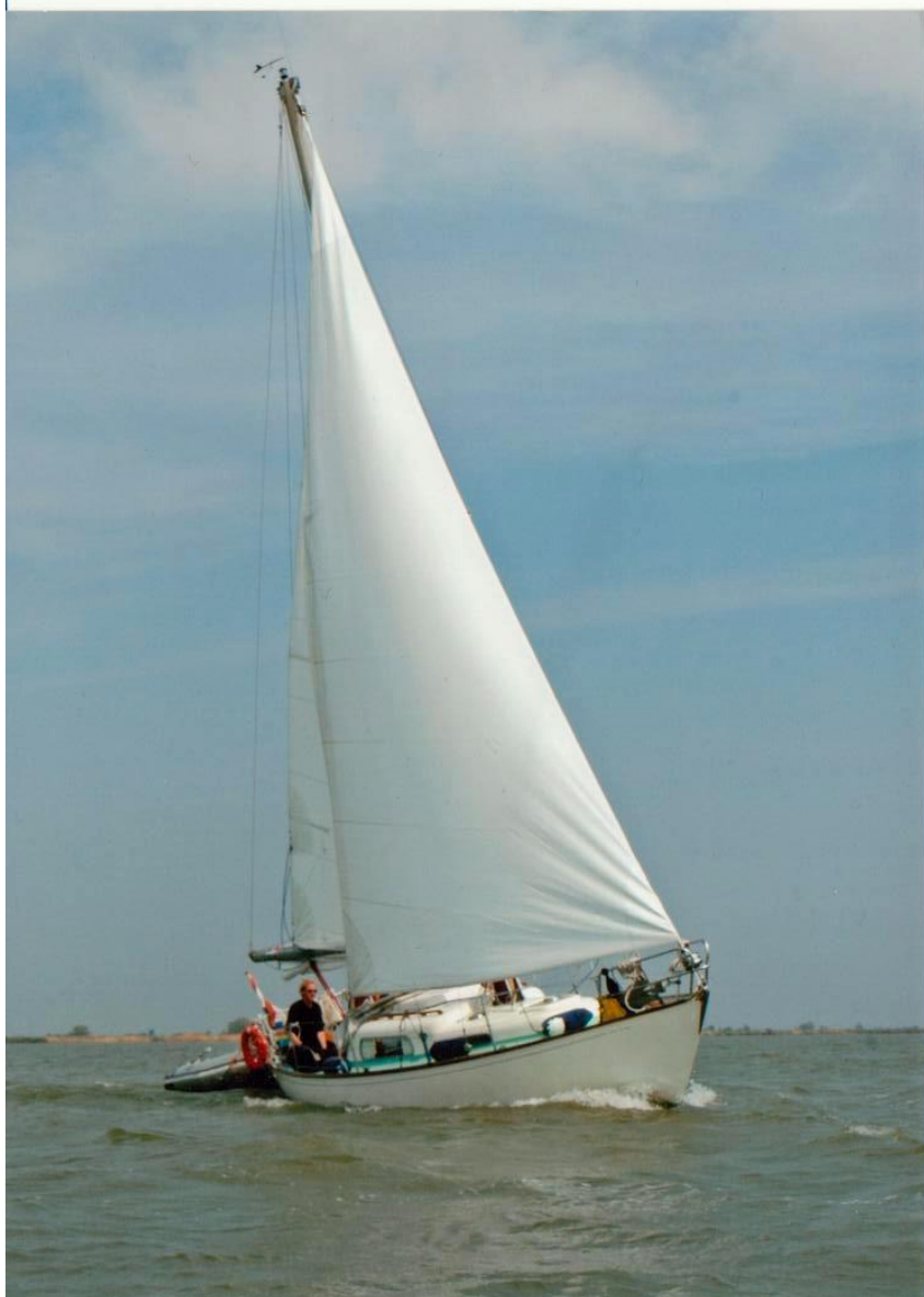
afb. 5 V28 longkeel hullnummer unknown 'Twaan'