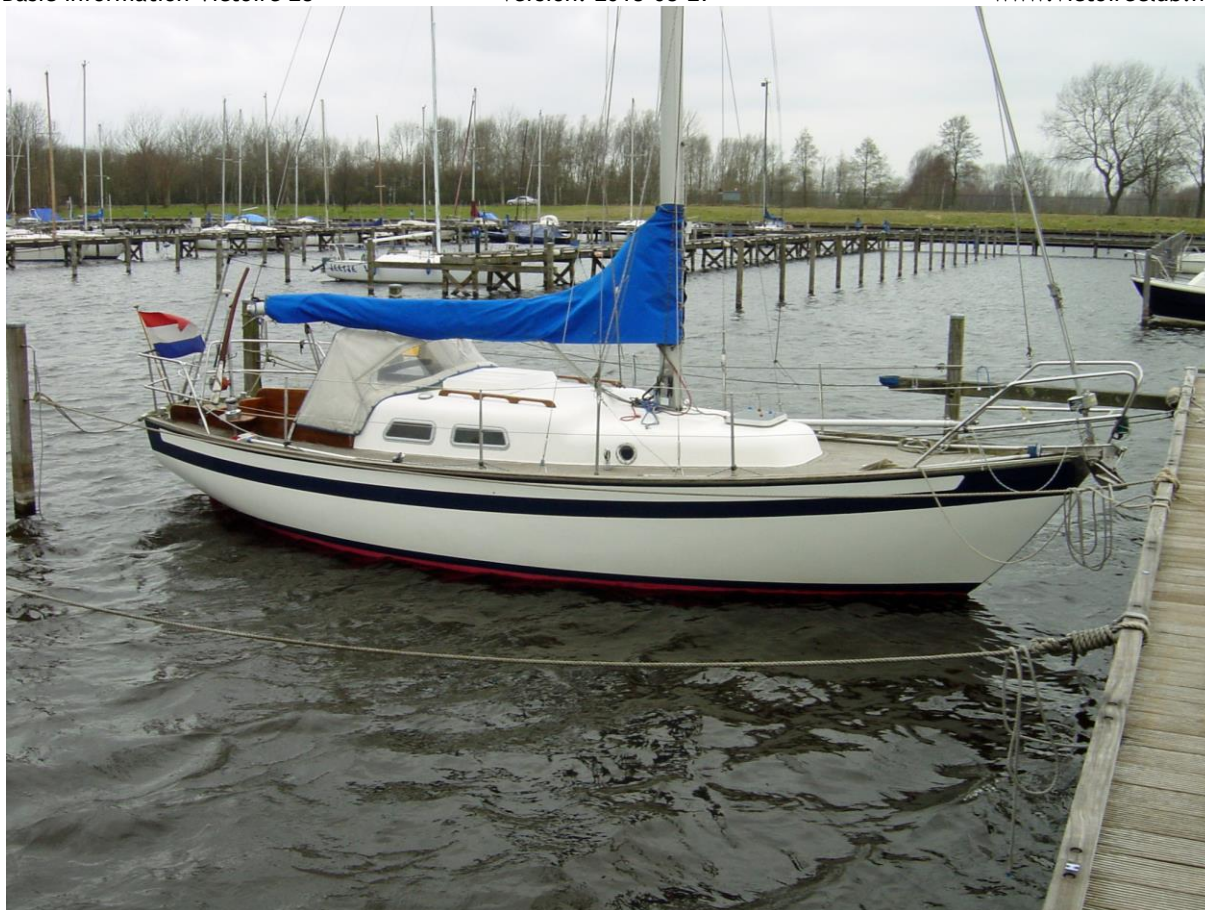
afb. 7 V28 1990, hullnumber unknown (photo 03-2003)